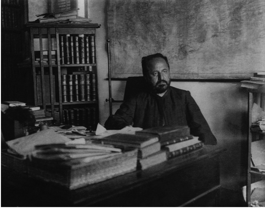
FIGURE 3.1 Sheikh Muḥammad Rashīd Riḍā (1865–1935) in his Al-Manār Office in Cairo (Family archive in Cairo)

miracle.” 15 In response, Ghulam Ahmad depicted Riḍā as a “jealous” and “arrogant” scholar who, like many others, not only rejected the message, but fueled the dislike of Indian Muslims against him and his followers. 16