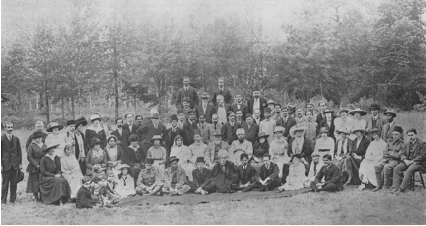
FIGURE 3.2 Id-ul-Fitr day at Woking, 10 July 1918 (The Islamic Review, August 1918)

for Islam in India and Europe, Riḍā finally concluded that the Ahmadis of both branches were followers of falsehood ( bāṭil ). 36